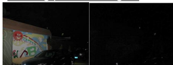
With white light