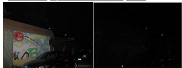
With white light