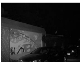
With IR light