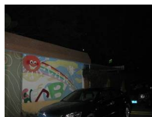
With white light