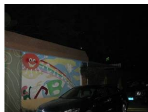
With white light