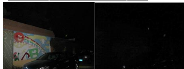
With white light