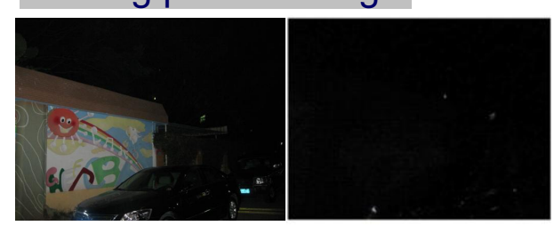
With white light