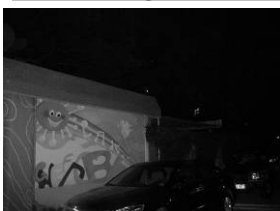
With IR light