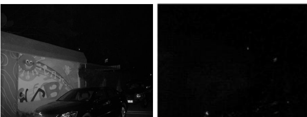
With IR light