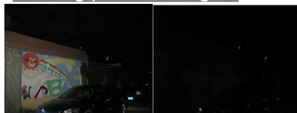
With white light