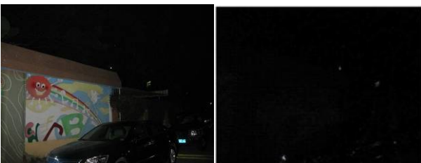
With white light