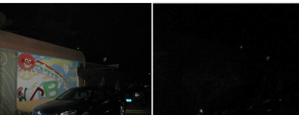
With white light