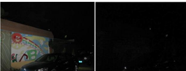
With white light